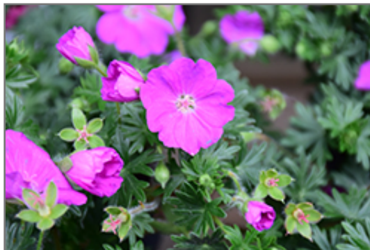
Max Frei Cranesbill flowers

Max Frei Cranesbill will grow to be about 8 inches tall at maturity, with a spread of 12 inches. When grown in masses or used as a bedding plant, individual plants should be spaced approximately 10 inches apart. Its foliage tends to remain low and dense right to the ground. It grows at a medium rate, and under ideal conditions can be expected to live for approximately 10 years. As an herbaceous perennial, this plant will usually die back to the crown each winter, and will regrow from the base each spring. Be careful not to disturb the crown in late winter when it may not be readily seen!