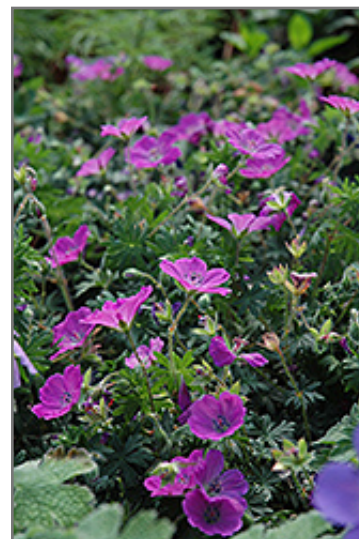
Max Frei Cranesbill flowers

This is a relatively low maintenance plant, and should only be pruned after flowering to avoid removing any of the current season's flowers. It is a good choice for attracting butterflies to your yard, but is not particularly attractive to deer who tend to leave it alone in favor of tastier treats. It has no significant negative characteristics.