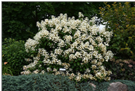
Quick Fire Hydrangea in bloom

This shrub performs well in both full sun and full shade. It prefers to grow in average to moist conditions, and shouldn't be allowed to dry out. It is not particular as to soil type or pH. It is highly tolerant of urban pollution and will even thrive in inner city environments. Consider applying a thick mulch around the root zone in winter to protect it in exposed locations or colder microclimates. This is a selected variety of a species not originally from North America.