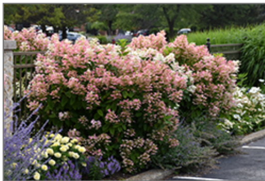
Quick Fire Hydrangea in bloom