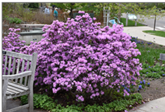
P.J.M. Rhododendron in bloom

P.J.M. Rhododendron is recommended for the following landscape applications;