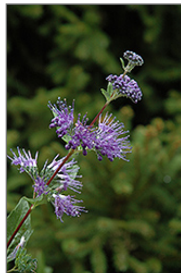
Blue Mist Caryopteris flowers

Blue Mist Caryopteris is recommended for the following landscape applications;