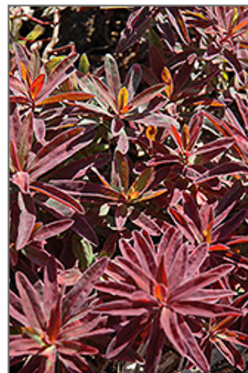
Bonfire Cushion Spurge foliage

Bonfire Cushion Spurge is recommended for the following landscape applications;