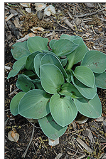
Blue Mouse Ears Hosta