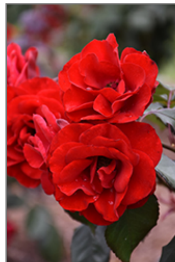
Europeana Rose flowers

The European Rose is recommended for the following landscape applications;