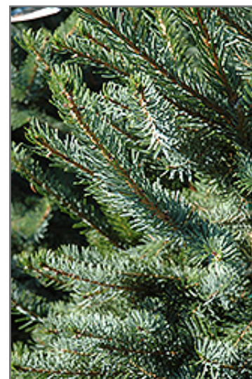
Bruns Spruce foliage