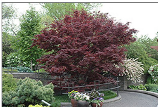
Bloodgood Japanese Maple