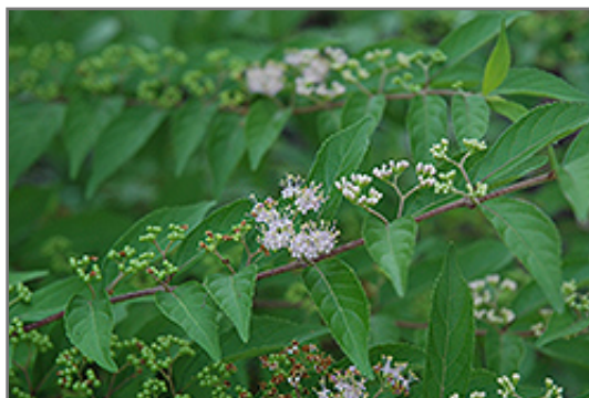
Issai Beautyberry flowers

Issai Beautyberry will grow to be about 4 feet tall at maturity, with a spread of 5 feet. It tends to fill out right to the ground and therefore doesn't necessarily require facer plants in front. It grows at a fast rate, and under ideal conditions can be expected to live for approximately 20 years.