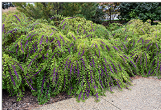
Issai Beautyberry fruit