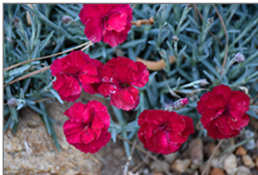
Frosty Fire Pinks flowers