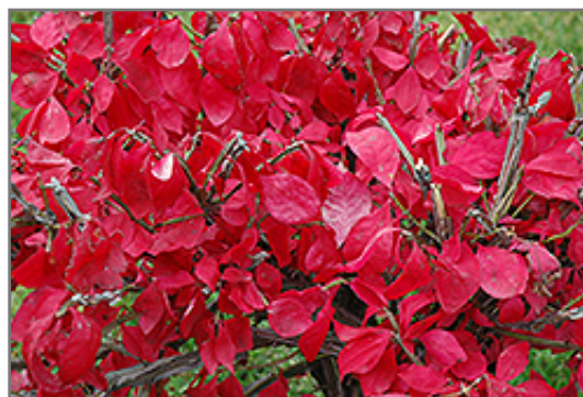
Compact Winged Burning Bush in fall