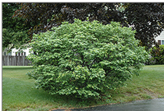
Compact Winged Burning Bush

Compact Winged Burning Bush will grow to be about 7 feet tall at maturity, with a spread of 7 feet. It tends to fill out right to the ground and therefore doesn't necessarily require facer plants in front, and is suitable for planting under power lines. It grows at a slow rate, and under ideal conditions can be expected to live for 50 years or more.