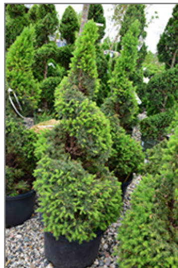
Dwarf Alberta Spruce (topiary form)