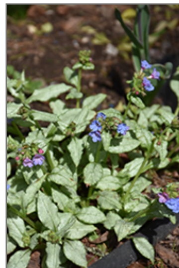
Moonshine Lungwort in bloom

This is a relatively low maintenance plant, and should be cut back in late fall in preparation for winter. It is a good choice for attracting hummingbirds to your yard, but is not particularly attractive to deer who tend to leave it alone in favor of tastier treats. It has no significant negative characteristics.