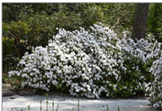
Delaware Valley White Azalea in bloom