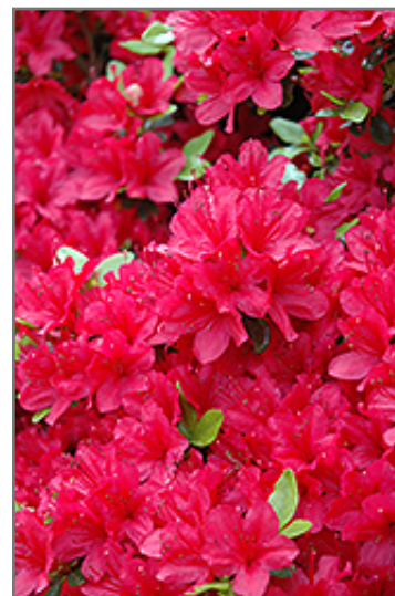
Hino Crimson Azalea flowers

Hino Crimson Azalea is recommended for the following landscape applications;