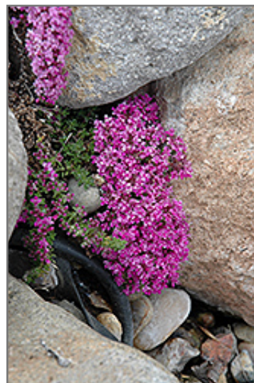
Pink Chintz Creeping Thyme in bloom

This plant should only be grown in full sunlight. It prefers to grow in average to dry locations, and dislikes excessive moisture. It is considered to be drought-tolerant, and thus makes an ideal choice for a low-water garden or xeriscape application. It is not particular as to soil type or pH. It is highly tolerant of urban pollution and will even thrive in inner city environments. Consider covering it with a thick layer of mulch in winter to protect it in exposed locations or colder microclimates. This is a selected variety of a species not originally from North America. It can be propagated by division; however, as a cultivated variety, be aware that it may be subject to certain restrictions or prohibitions on propagation.