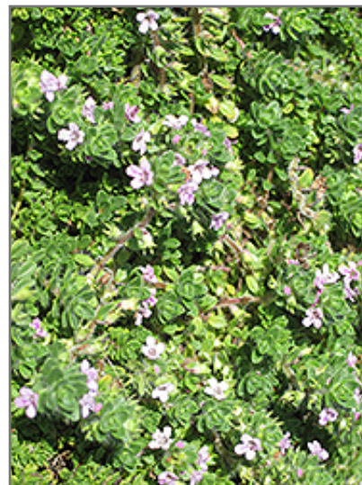
Pink Chintz Creeping Thyme flowers