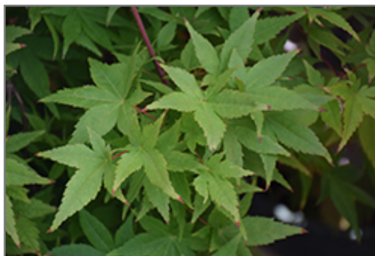
Ryusen Japanese Maple foliage