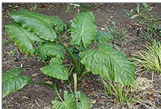
Elephant's Ear