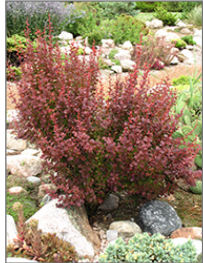
Orange Rocket Japanese Barberry

This shrub does best in full sun to partial shade. It is very adaptable to both dry and moist growing conditions, but will not tolerate any standing water. It is considered to be drought-tolerant, and thus makes an ideal choice for xeriscaping or the moisture-conserving landscape. It is not particular as to soil type or pH, and is able to handle environmental salt. It is highly tolerant of urban pollution and will even thrive in inner city environments. This is a selected variety of a species not originally from North America.