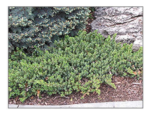
Dwarf Japanese Garden Juniper

This is a relatively low maintenance shrub, and is best pruned in late winter once the threat of extreme cold has passed. Deer don't particularly care for this plant and will usually leave it alone in favor of tastier treats. It has no significant negative characteristics.