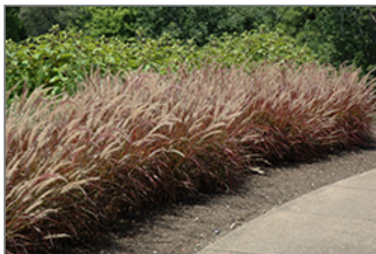
Purple Fountain Grass in bloom

Purple Fountain Grass will grow to be about 4 feet tall at maturity, with a spread of 3 feet. Although it's not a true annual, this plant can be expected to behave as an annual in our climate if left outdoors over the winter, usually needing replacement the following year. As such, gardeners should take into consideration that it will perform differently than it would in its native habitat.