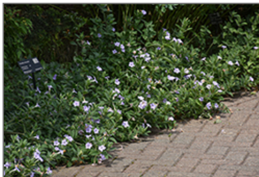
Hairy Wild Petunia in bloom