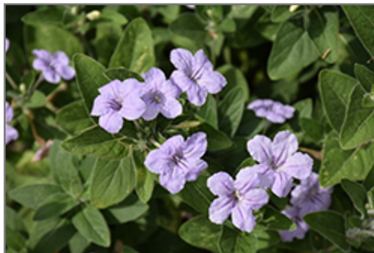
Hairy Wild Petunia flowers

Hairy Wild Petunia is recommended for the following landscape applications;