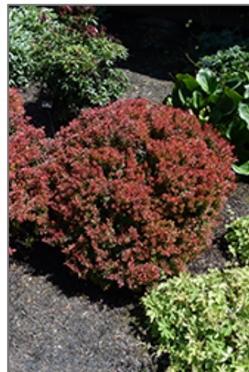
Golden Ruby Barberry