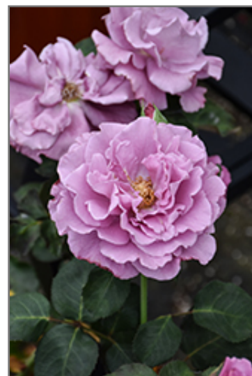
Angel Face Rose flowers