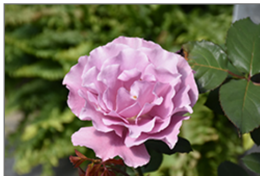
Angel Face Rose flowers

Angel Face Rose is recommended for the following landscape applications;