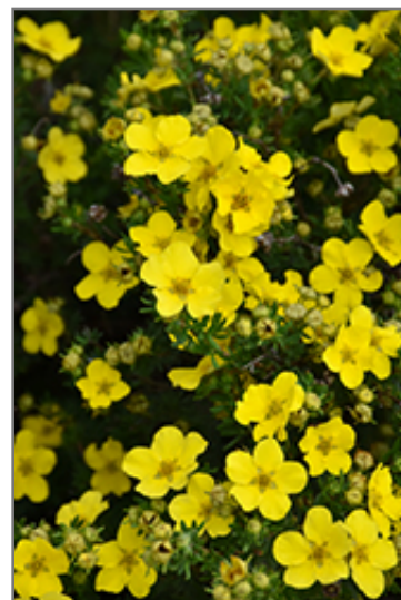
Dakota Sunspot Potentilla flowers