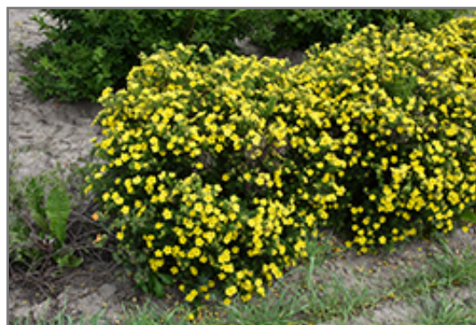
Dakota Sunspot Potentilla in bloom