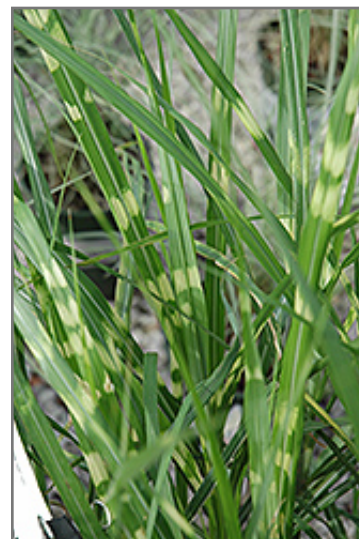
Porcupine Grass foliage

Porcupine Grass features bold plumes of rose flowers rising above the foliage in late summer. Its attractive grassy leaves are bluish-green in color with showy gold variegation. The foliage often turns yellow in fall. The silver seed heads are carried on showy plumes displayed in abundance from early fall to late winter. The brick red stems are very colorful and add to the overall interest of the plant.