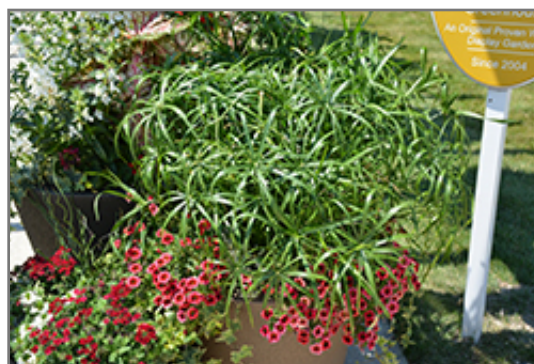
Baby Tut Umbrella Grass