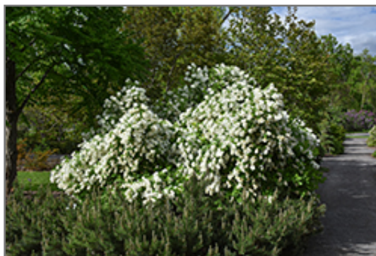
Snow Day Surprise Pearlbus in bloom