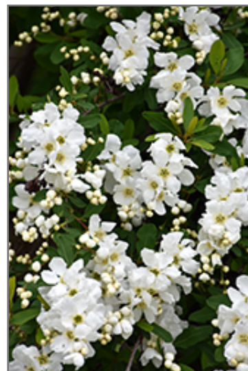
Snow Day Surprise Pearlbus flowers

Snow Day Surprise Pearlbus is recommended for the following landscape applications;