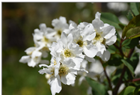
Snow Day Surprise Pearlshrub flowers

Snow Day Surprise Pearlshrub will grow to be about 4 feet tall at maturity, with a spread of 4 feet. It tends to fill out right to the ground and therefore doesn't necessarily require facer plants in front. It grows at a medium rate, and under ideal conditions can be expected to live for approximately 30 years.