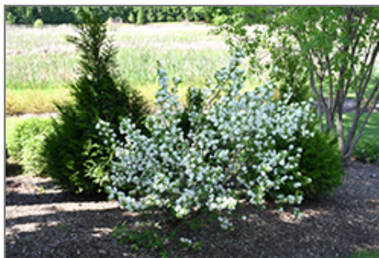
Snow Day Surprise Pearlbus in bloom