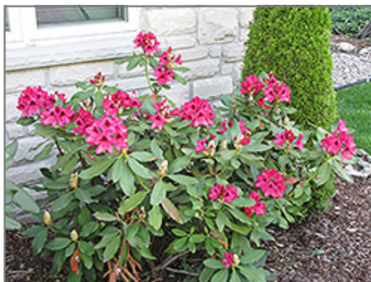
Nova Zembla Rhododendron in bloom