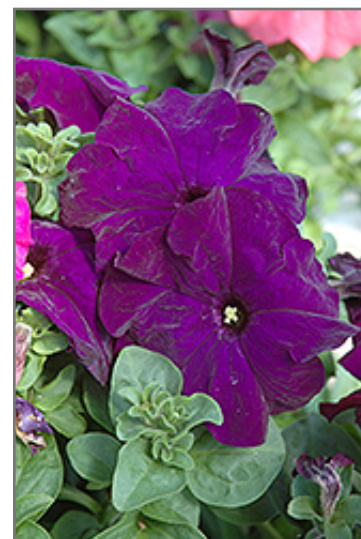
Dreams Midnight Petunia flowers