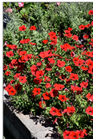
Easy Wave Red Petunia flowers