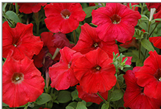
Easy Wave Red Petunia flowers

This plant will require occasional maintenance and upkeep. Trim off the flower heads after they fade and die to encourage more blooms late into the season. It is a good choice for attracting hummingbirds to your yard, but is not particularly attractive to deer who tend to leave it alone in favor of tastier treats. It has no significant negative characteristics.