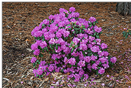
Compact P.J.M. Rhododendron in bloom