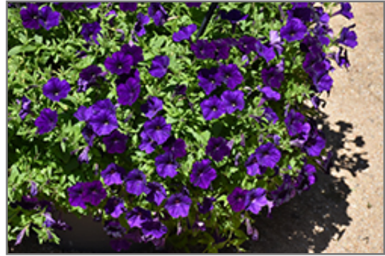
Supertunia Royal Velvet Petunia flowers

Supertunia Royal Velvet Petunia is a fine choice for the garden, but it is also a good selection for planting in outdoor containers and hanging baskets. Because of its trailing habit of growth, it is ideally suited for use as a 'spiller' in the 'spiller-thriller-filler' container combination; plant it near the edges where it can spill gracefully over the pot. Note that when growing plants in outdoor containers and baskets, they may require more frequent waterings than they would in the yard or garden.