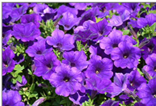
Supertunia Royal Velvet Petunia flowers