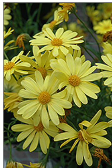
Voltage Yellow African Daisy flowers