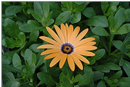
Orange Symphony African Daisy flowers