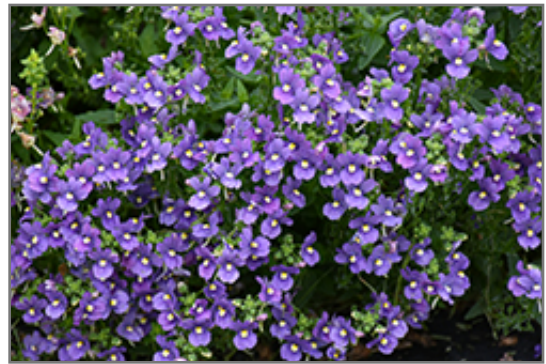
Bluebird Nemesis flowers