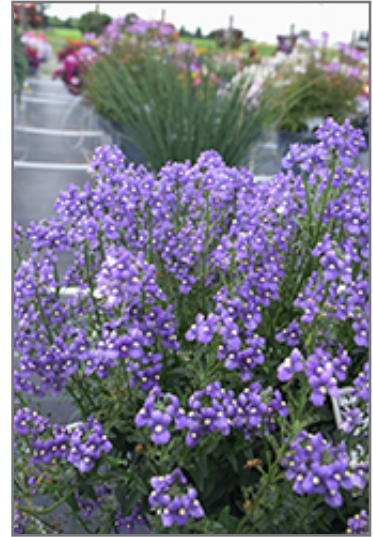
Bluebird Nemesis flowers