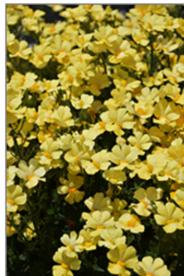
Sunsatia Lemon Nemesia flowers