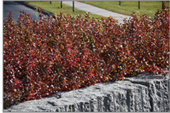
Gro-Low Fragrant Sumac in fall

This shrub performs well in both full sun and full shade. It is very adaptable to both dry and moist locations, and should do just fine under typical garden conditions. It is not particular as to soil type, but has a definite preference for acidic soils, and is subject to chlorosis (yellowing) of the foliage in alkaline soils. It is highly tolerant of urban pollution and will even thrive in inner city environments. Consider applying a thick mulch around the root zone in winter to protect it in exposed locations or colder microclimates. This is a selection of a native North American species.