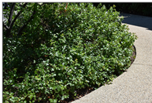
Gro-Low Fragrant Sumac

Gro-Low Fragrant Sumac is recommended for the following landscape applications;