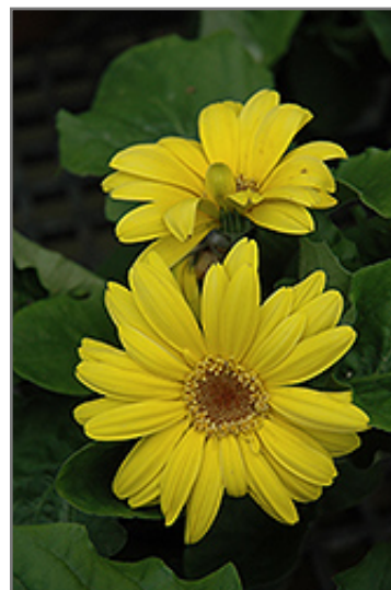
Yellow Gerbera Daisy flowers

Yellow Gerbera Daisy is recommended for the following landscape applications;