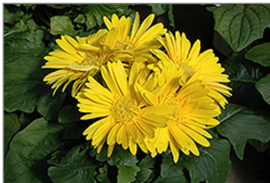
Yellow Gerbera Daisy flowers