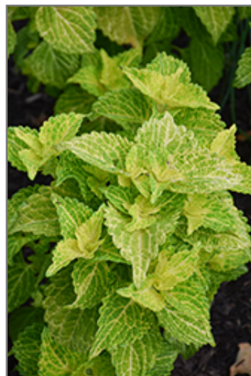
Electric Lime Coleus foliage