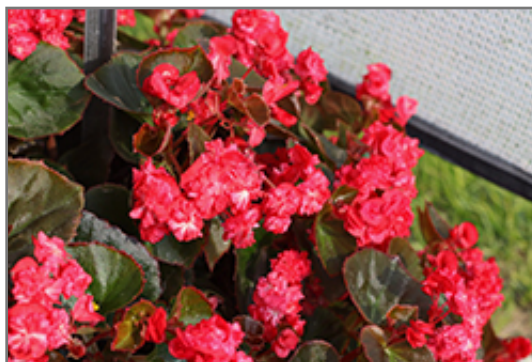
Doublet Red Begonia flowers