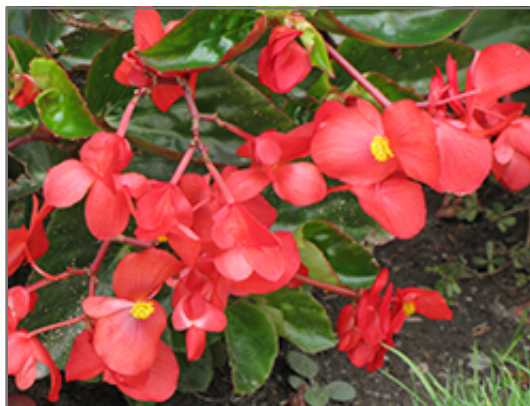
Dragon Wing Red Begonia flowers

Dragon Wing Red Begonia is an herbaceous annual with a trailing habit of growth, eventually spilling over the edges of hanging baskets and containers. Its medium texture blends into the garden, but can always be balanced by a couple of finer or coarser plants for an effective composition.