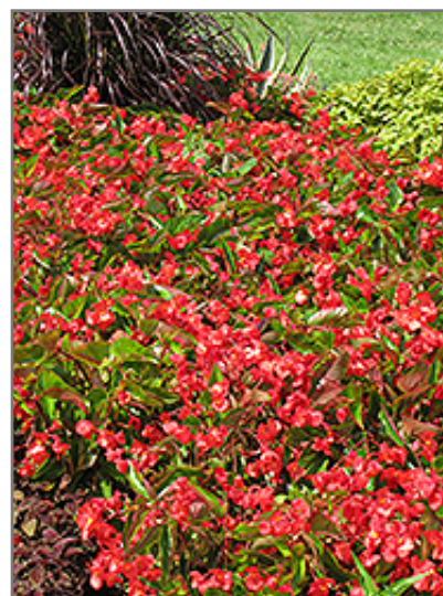
Dragon Wing Red Begonia in bloom