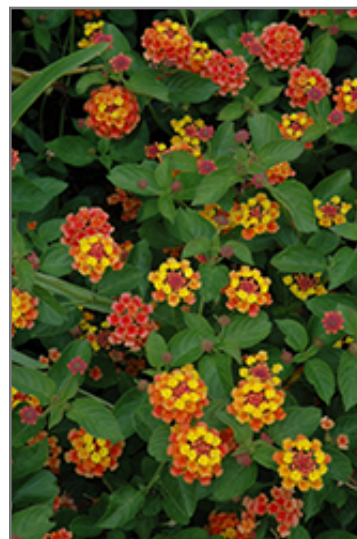
Landmark Citrus Lantana flowers