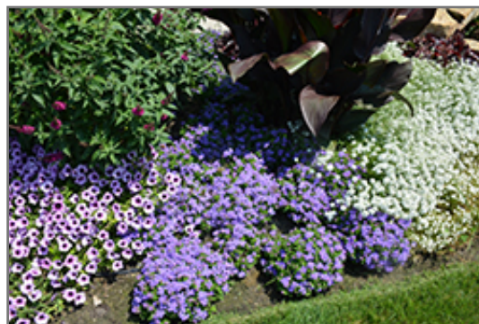
Artist Blue Flossflower in bloom

Artist Blue Flossflower is a fine choice for the garden, but it is also a good selection for planting in outdoor containers and hanging baskets. It is often used as a 'filler' in the 'spiller-thriller-filler' container combination, providing a mass of flowers against which the thriller plants stand out. Note that when growing plants in outdoor containers and baskets, they may require more frequent waterings than they would in the yard or garden.