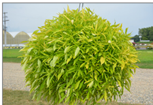
Illusion Emerald Lace Sweet Potato Vine