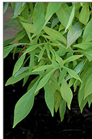
Illusion Emerald Lace Sweet Potato Vine foliage