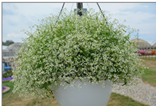
Diamond Frost Euphorbia in bloom

Diamond Frost Euphorbia is a fine choice for the garden, but it is also a good selection for planting in outdoor containers and hanging baskets. It is often used as a 'filler' in the 'spiller-thriller-filler' container combination, providing a mass of flowers against which the thriller plants stand out. Note that when growing plants in outdoor containers and baskets, they may require more frequent waterings than they would in the yard or garden.