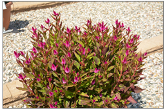
Intenz Classic Celosia in bloom

Intenz Classic Celosia will grow to be about 14 inches tall at maturity, with a spread of 12 inches. When grown in masses or used as a bedding plant, individual plants should be spaced approximately 10 inches apart. Its foliage tends to remain dense right to the ground, not requiring facer plants in front. This fast-growing annual will normally live for one full growing season, needing replacement the following year.