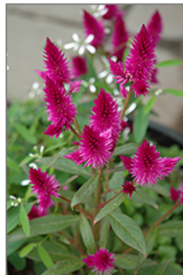
Intenz Classic Celosia flowers

Intenz Classic Celosia is recommended for the following landscape applications;