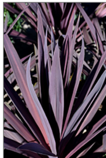
Bauer's Cordyline foliage