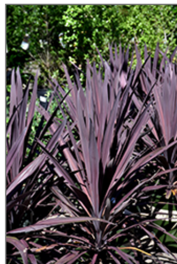
Bauer's Cordyline