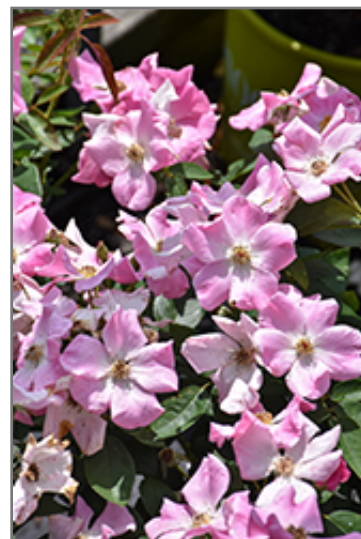
Nearly Wild Rose flowers