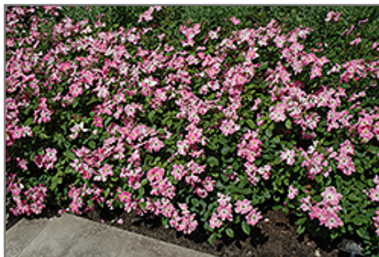
Nearly Wild Rose in bloom